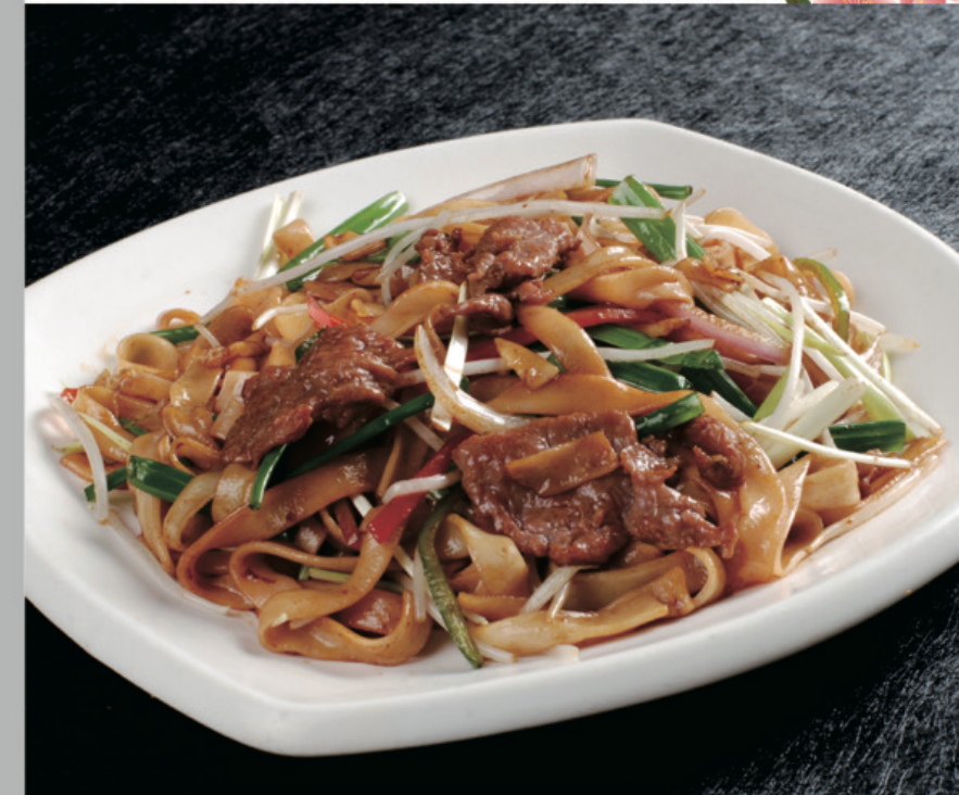
097 干炒牛河 ----- £13.50 Stir Fried Beef Ho Fun with Spring Onions (Dry)

096 鸡肉乌冬 ----- £12.00 Chicken Udon in Homemade Sweet Soya Sauce