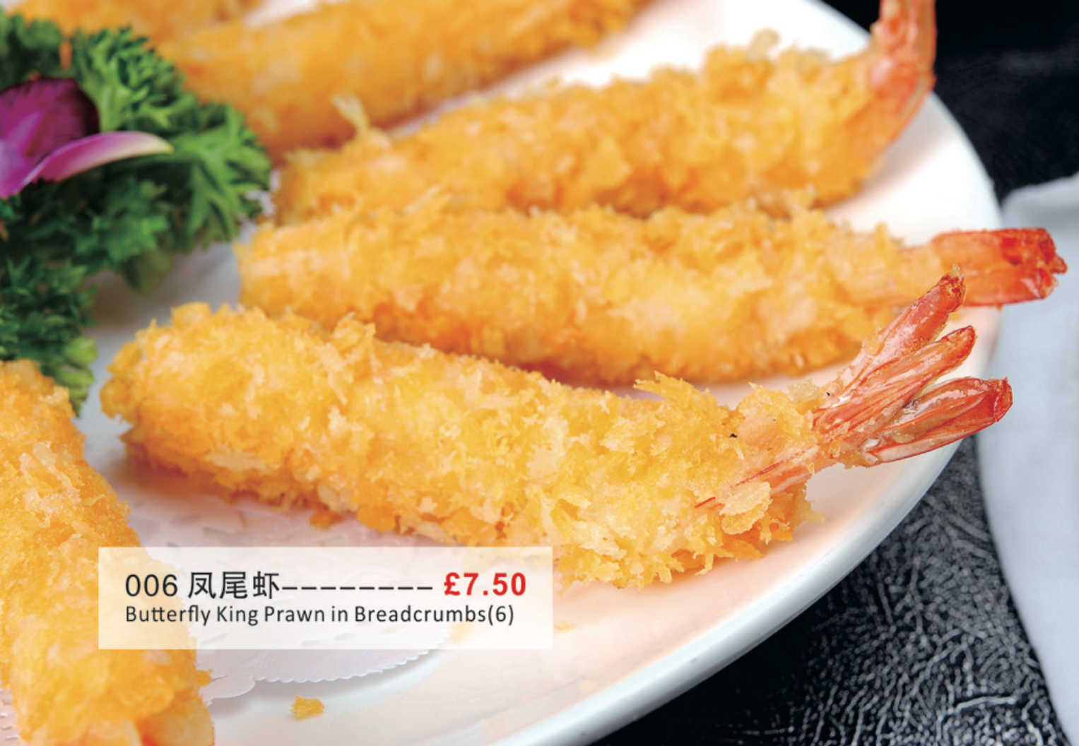
006 凤尾虾----- £7.50 Butterfly King Prawn in Breadcrumbs(6)

图片仅供参考 出品以实物为准/Picture is for reference only