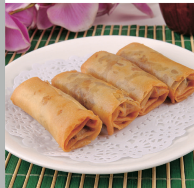
002 春卷 ----- £6.00 Meat Spring Rolls (2)