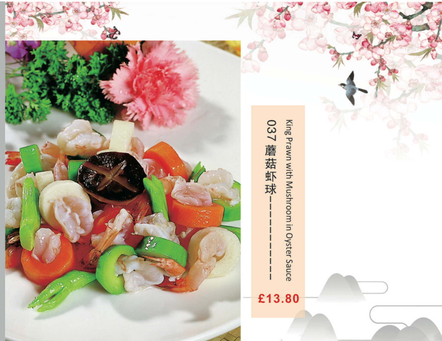
King Prawn with Mushroom in Oyster Sauce 037 蘑菇虾球 -----

图片仅供参考 出品以实物为准/Picture is for reference only