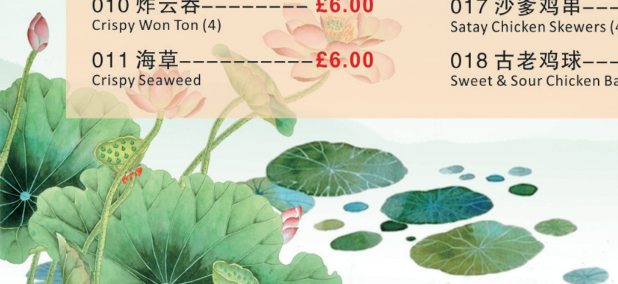
018 古老鸡球----- £8.50 Sweet & Sour Chicken Balls (6)