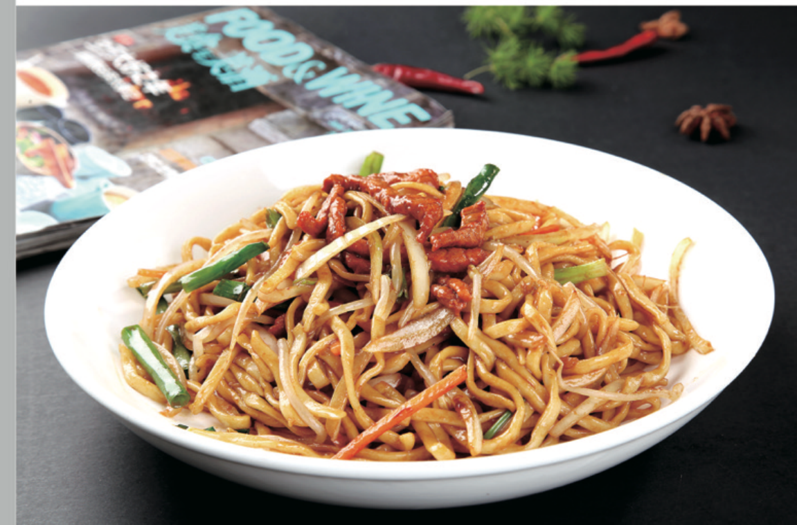
House Special Chow Mein (Chicken, Beef, Char Siu & King Prawn) 102 招牌炒面 ----- £13.00

101 鸭丝炒面 ----- £13.50 Roast Duck Chow Mein