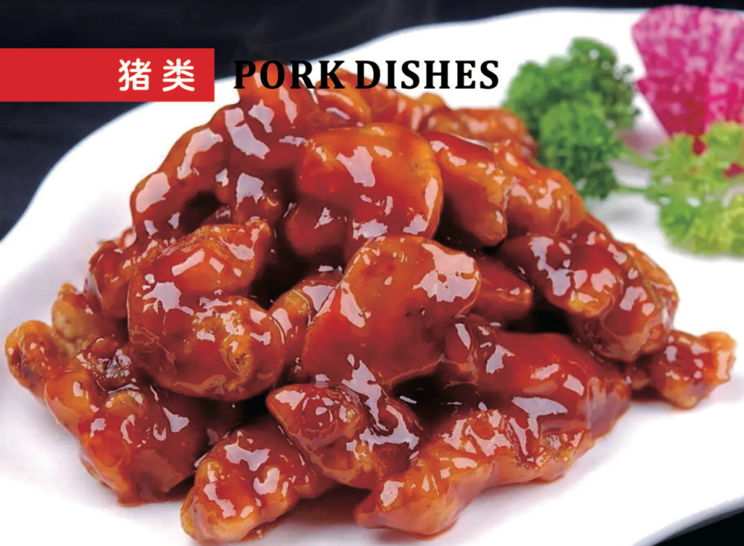
068 甜酸肉 ----- £13.00 Sweet & Sour Pork Hong Kong Style