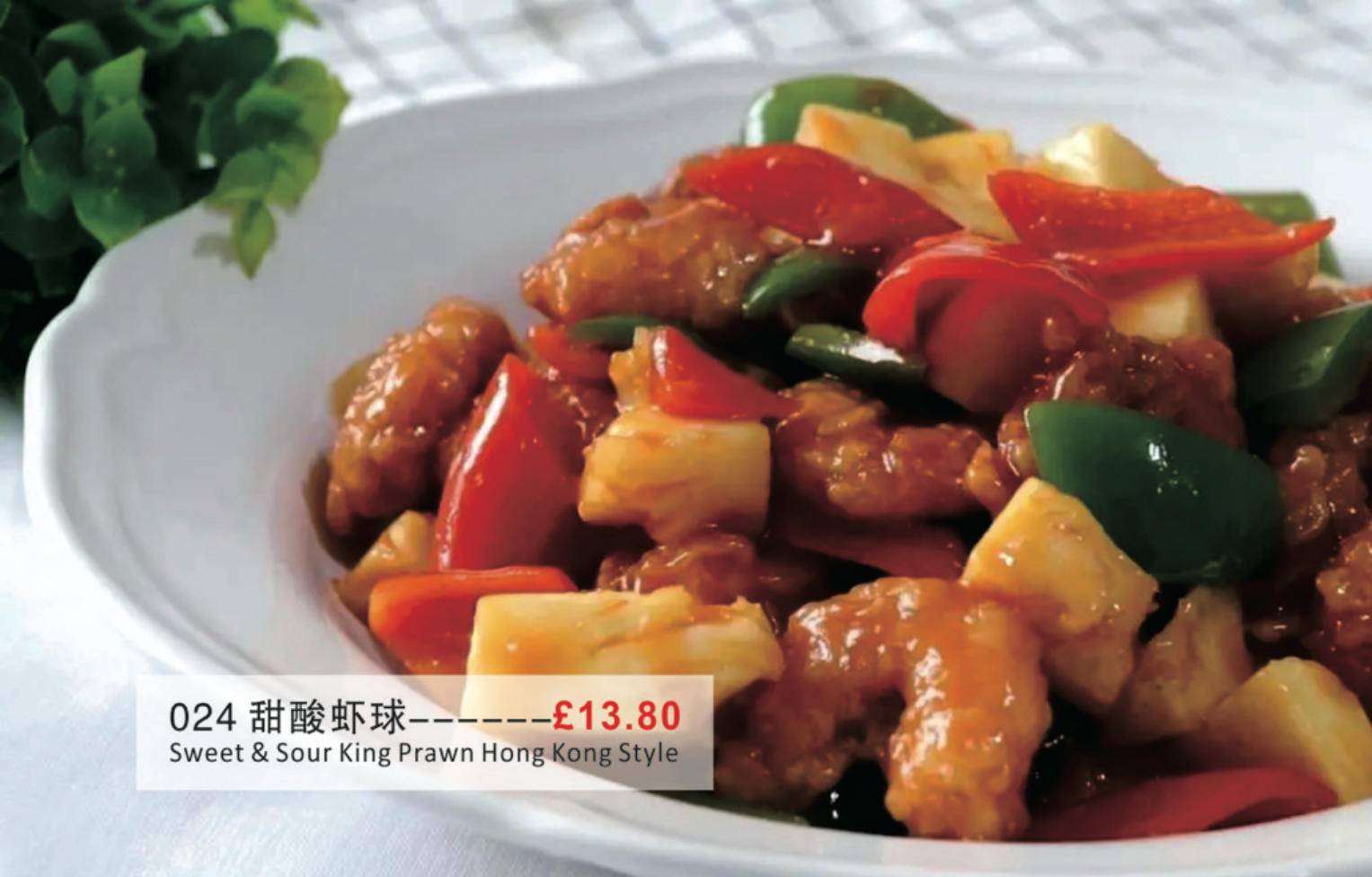
024 甜酸虾球 ----- £13.80 Sweet & Sour King Prawn Hong Kong Style

图片仅供参考 出品以实物为准/Picture is for reference only