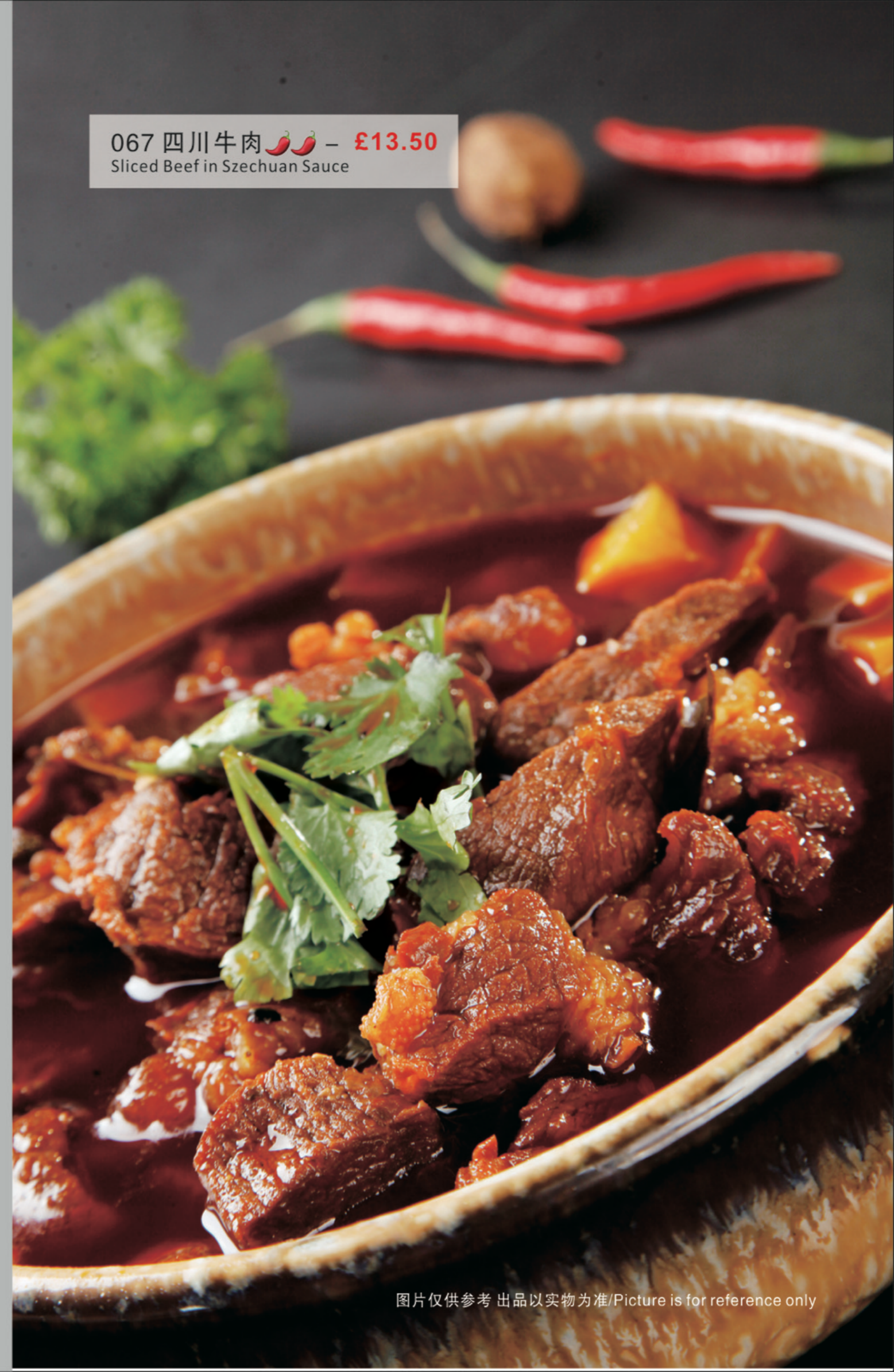
067 四川牛肉 🌶️🌶️ - £13.50 Sliced Beef in Szechuan Sauce

图片仅供参考 出品以实物为准/Picture is for reference only