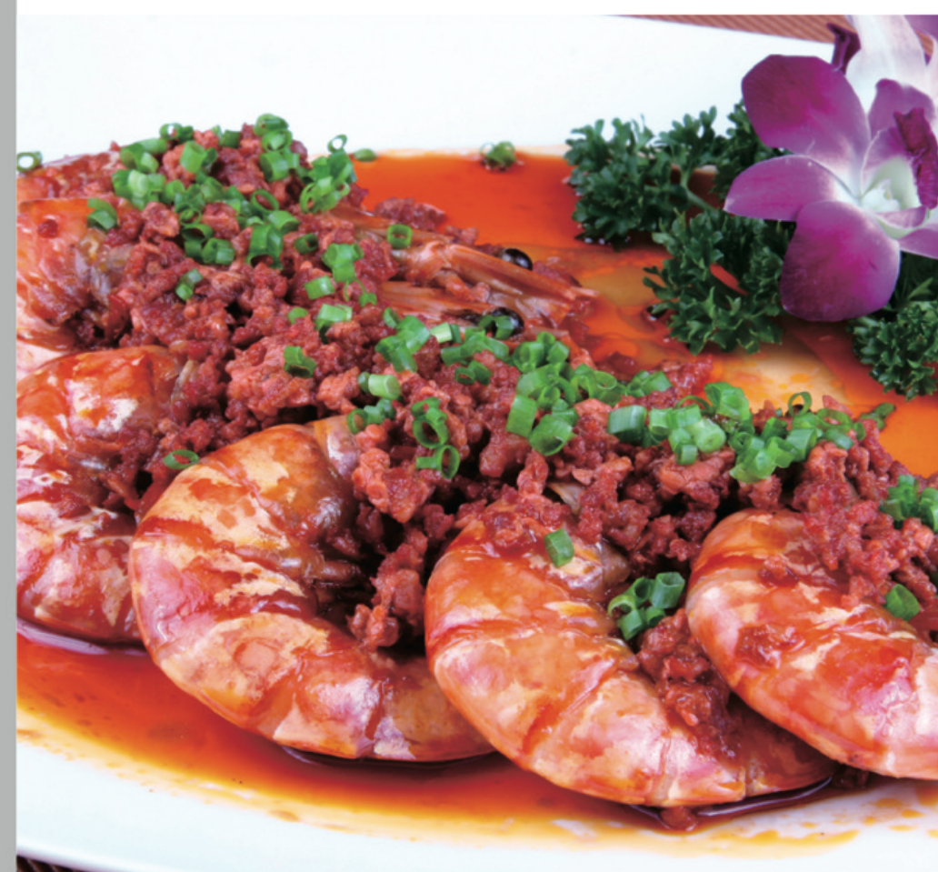
King Prawn in Shell with Tomato & Garlic Sauce 038 干烧明虾 -----