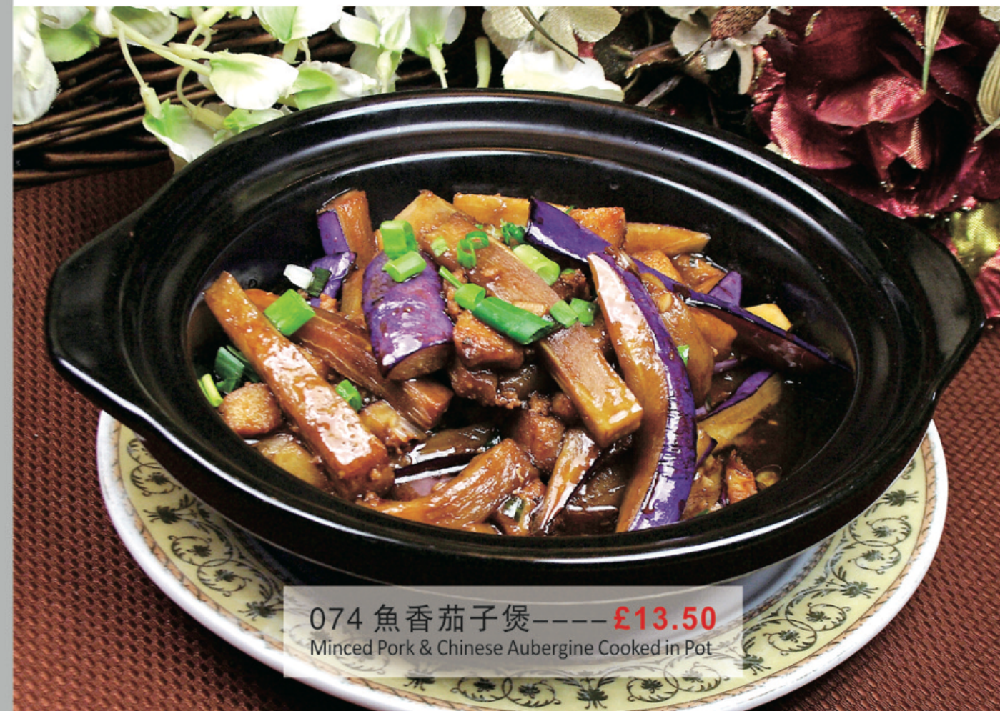
074 鱼香茄子煲 ----- £13.50 Minced Pork & Chinese Aubergine Cooked in Pot