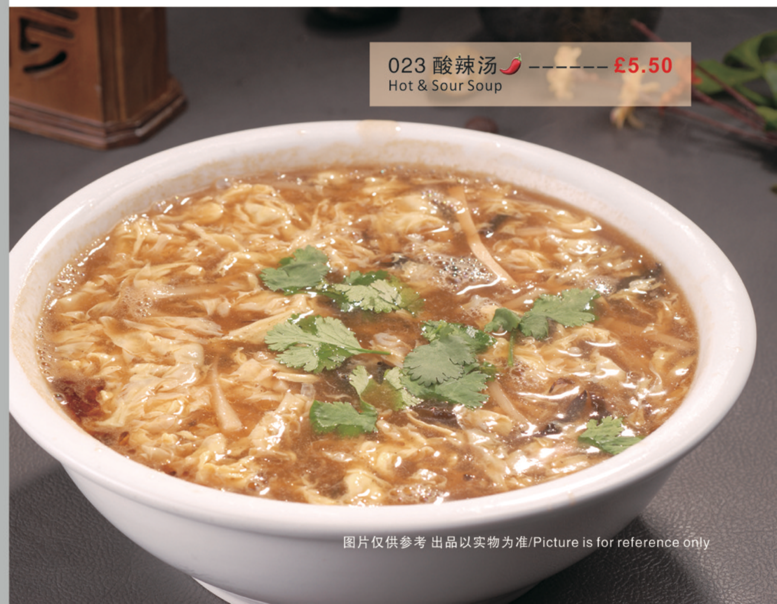
023 酸辣汤 🌶️ ----- £5.50 Hot & Sour Soup

图片仅供参考 出品以实物为准/Picture is for reference only