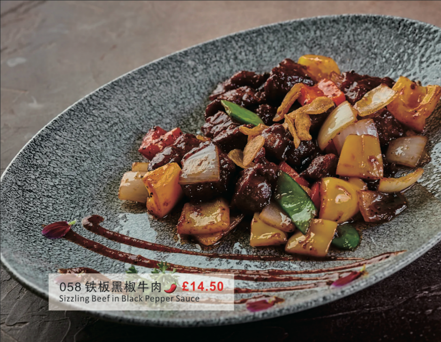
058 铁板黑椒牛肉 🌶️ £14.50 Sizzling Beef in Black Pepper Sauce