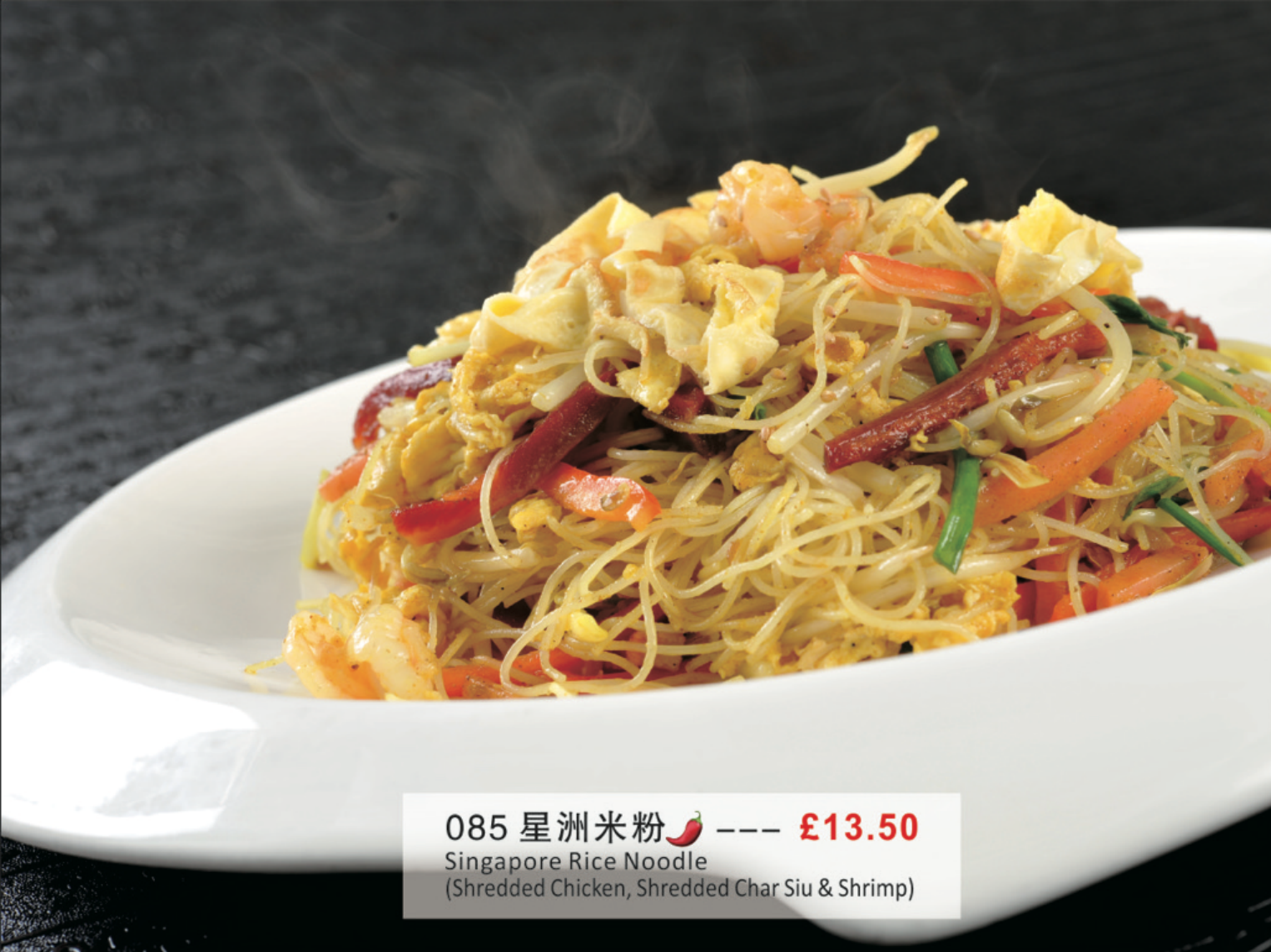
085 星洲米粉 🌶️ --- £13.50 Singapore Rice Noodle (Shredded Chicken, Shredded Char Siu & Shrimp)